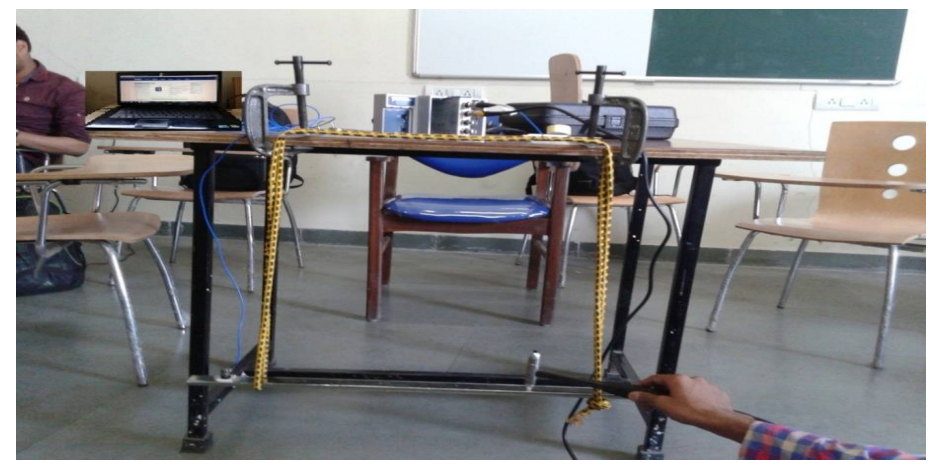
Fig.1. Actual Experimental Set-up

Visit: <u>www.ijirset.com</u> Vol. 6, Issue 11, November 2017